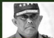
JENDERAL TNI (PURN) DJOKO SANTOSO