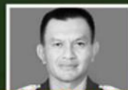
LETJEN TNI (PURN) LODEWIJK F. PAULUS