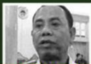
BRIGJEN (PURN) HERWIN SUPARDJO