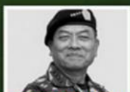
JENDERAL TNI (PURN) MOELDOKO