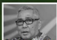
JENDERAL TNI (PURN) TRY SOETRISNO