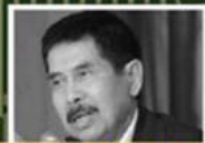
LETJEN TNI (PURN) YUNUS YOSFIAH