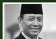
JENDERAL TNI (PURN) WIRANTO