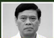
LAKSAMANA TNI (PURN) TEDJO EDHY P.