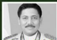
LAKSAMANA TNI (PURN) MARSETYO