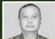
LETJEN (PURN) YAYAT SUDRAJAT