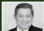
JENDERAL TNI (PURN) SUSILO BAMBANG Y.