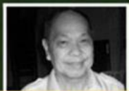
MAYJEN (PURN) GLENNY KAIRUPAN